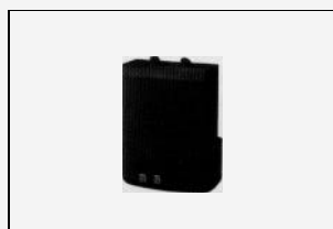
● EBP-36N Ni-Cd Battery Pack 9.6V DC 650mA for 5W output