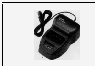
● EDC60 Rapid Charger (120V) ● EDC-61 Rapid Charger (220V)