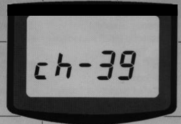
LCD actual size